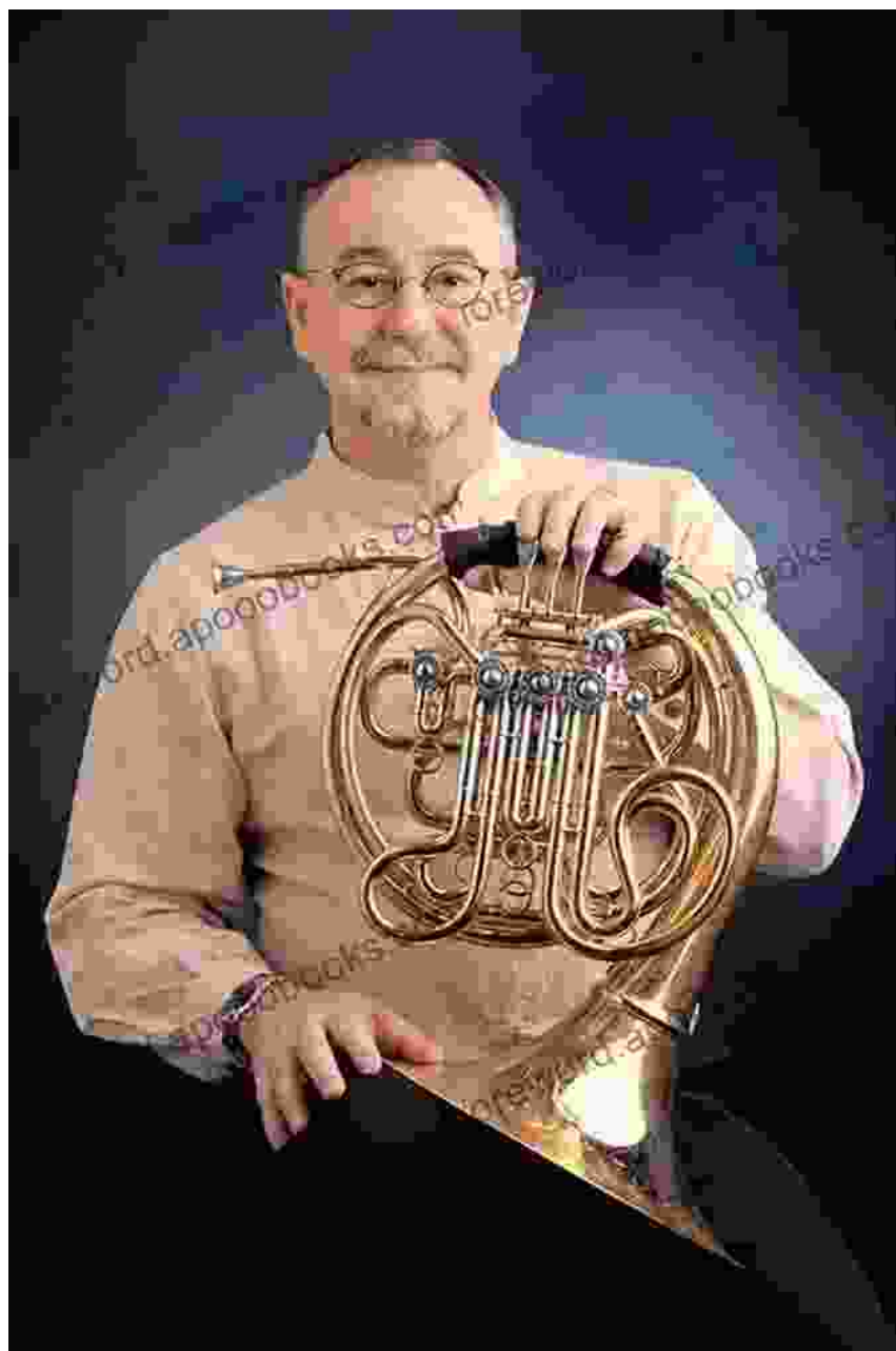
Image: Horn soloist captivating the audience with a mesmerizing performance