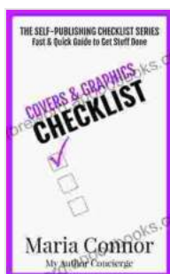
Image alt: An image of the Covers Graphics Checklist, a comprehensive guide to designing stunning book covers.

Don't let a weak book cover sabotage your publishing goals. The Covers Graphics Checklist is the ultimate solution for authors who want to design eye-catching covers that boost sales and marketing results. Free Download your copy today and elevate your book to the next level.